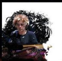
Vana Trio plus Brazilian percussion Live